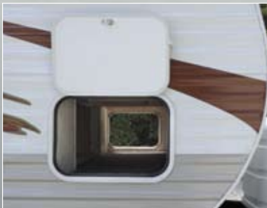
Lighted pass through storage is standard in all our floors.