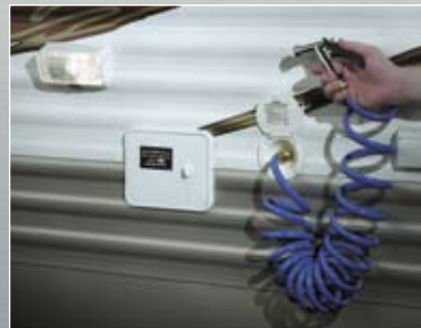
The detachable Spray Port extends a full 20' and can be used for anything from cleaning your feet to washing your car.