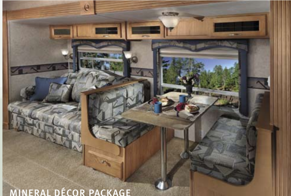
MINERAL DÉCOR PACKAGE

Our interiors are designed with you in mind. Beautifully decorated and packed with residential-style features, our travel trailers are everything you are looking for in your home away from home.