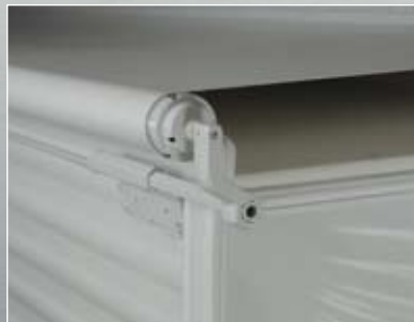
The optional slide awning topper keeps the slide clean and free of debris.