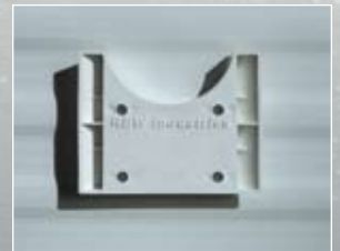
Mount the TV on this bracket to enjoy your favorite sporting event or a good movie outside under the awning.