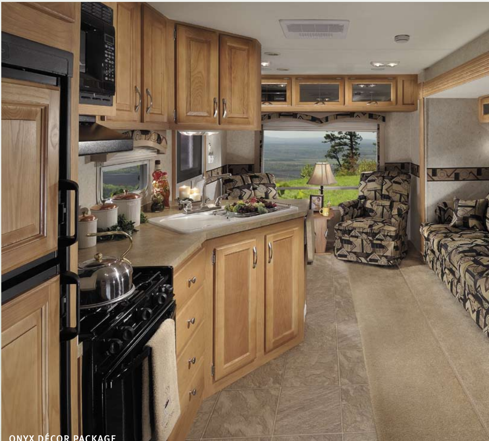
ONYX DÉCOR PACKAGE